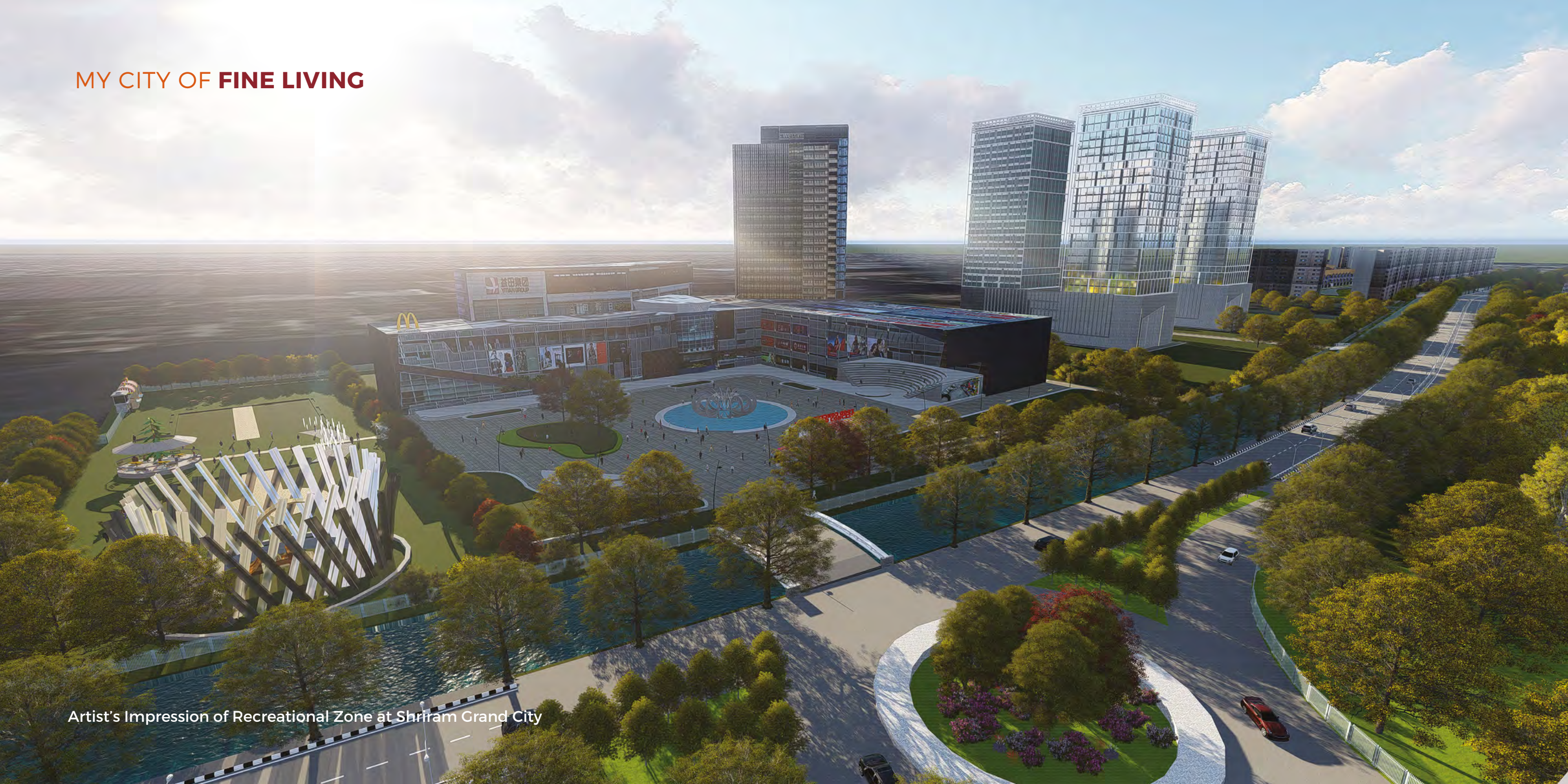
Artist's Impression of Recreational Zone at Shriram Grand City