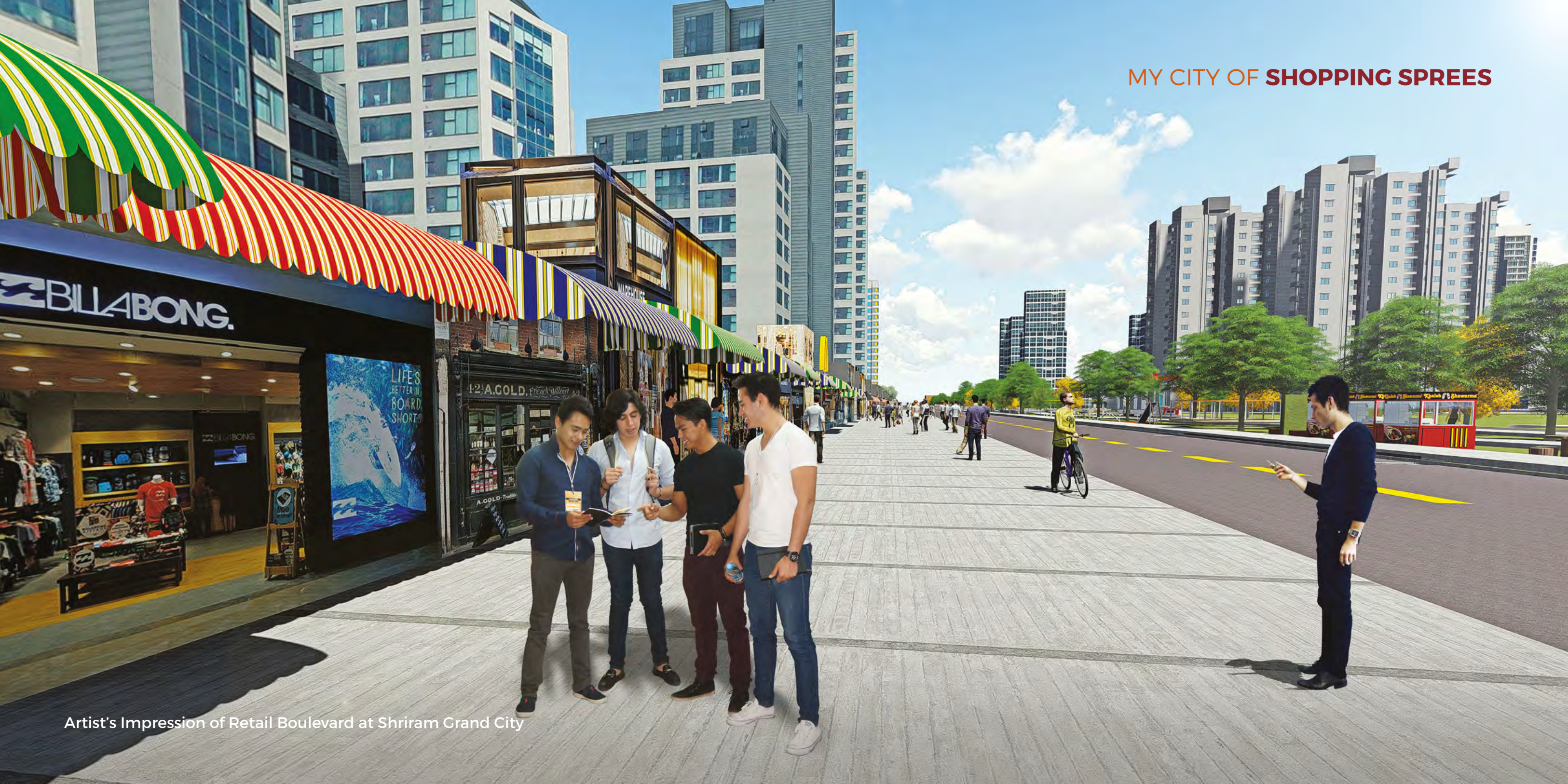
Artist's Impression of Retail Boulevard at Shriram Grand City